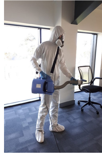
Momentum Support Industrial Team supporting our clients requirements during COVID - 19 using our spray method - cleaning and disinfection service.

momentum supports its Workforce & its Communities through mental health and wellbeing awareness with our Charity Partner Suicide or Survive SOS.